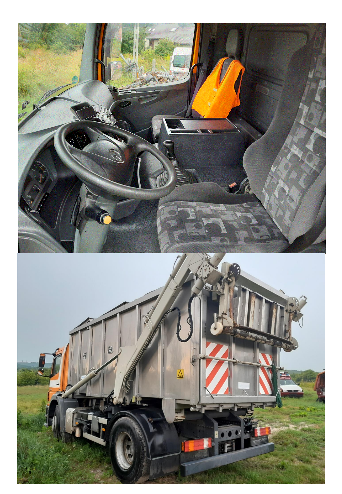
Description : The car and bodywork are in very good technical condition. (1 owner). Two-chamber, tight bodywork divided in the ratio of 1/3 to 2/3 of the volume, with the possibility